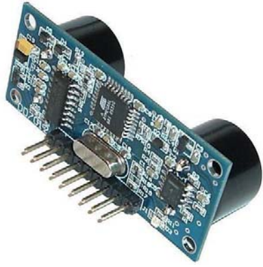
URM37 V3.2 Ultrasonic Sensor Manual