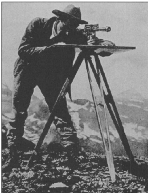
Surveying the scene. Early USGS mappers used plane tables and alidades to get the lay of the land.

USGS is an old hand at topography. Soon after its founding in 1879, pioneering cartographers fanned across a rugged landscape, mapping the horizon on