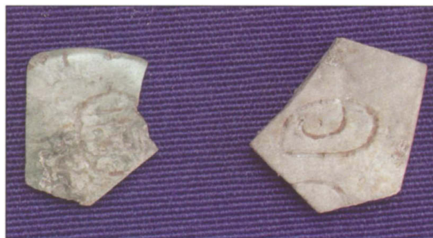
San Andrés treasure. The oval glyphs on these thumbnail-sized plaques, arranged in a column on the righthand piece, might be fragments of text.