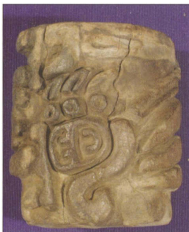
Important date. The dotted symbol on this fist-sized seal, which is spoken by a bird, might be the oldest evidence for the Mesoamerican calendar.