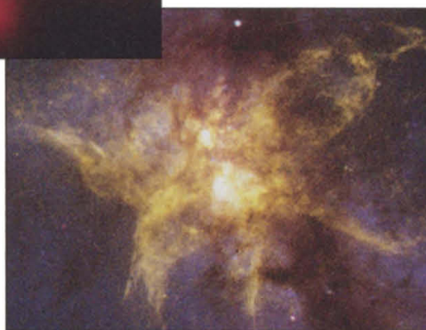
Twin peeks. X-ray image (top) reveals two black holes at the core of a galactic merger.

of our sun. The distance between them, 3000 light-years, means that they must rotate around their common center over a period of millions of years. Over hundreds of millions of years, the two bodies will spiral toward each other, giving off energy in the form of gravitational waves, and ultimately merge. Such mergers might explain why some galaxies don't show an increased concentra-