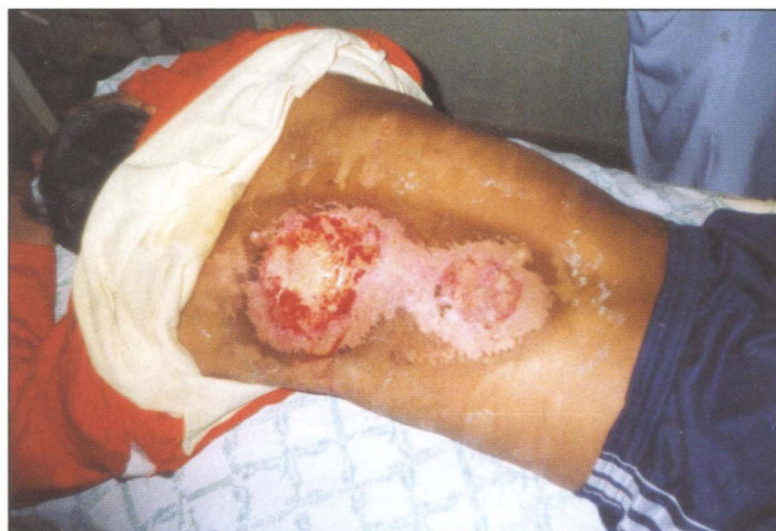
Irradiated. Georgian doctors covered this man's radiation burns with patches that released bacteriophages into the wound as they degraded.