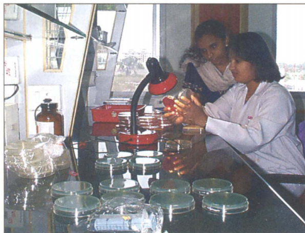
Back to the future. More than a century after a British chemist caught the first whiff of phage in water from the Ganges River, the firm GangaGen is hoping to put Bangalore on the phage-therapy map.

Some companies are trying to exploit such eccentricities of phages in their quest for new drugs. For instance, PhageTech in St. Laurent, Canada, is studying a myriad of phage "killer" proteins that derail the host