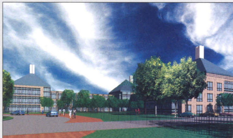
Grand plans. The University of California, Davis, hopes the new NIH program will help fund a $190 million bioterrorism research center, including a biosafety level-4 lab.

With advice from several expert panels, NIAID has begun to