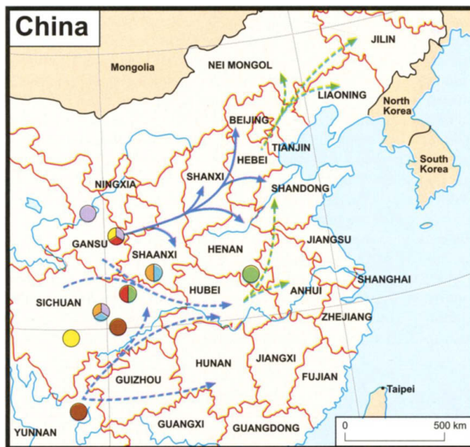
Fig. 2. Dispersal of the wheat yellow rust pathogen, Puccinia striiformis f. sp. tritici , in China. The main area of winter wheat cultivation includes Shaanxi, Henan, Hebei, and Shandong provinces. Solid blue arrows show dispersal of uredospores from southern Gansu province to the main wheat-growing area in autumn (35–38). Dashed arrows indicate additional proposed pathways of uredospore dispersal in autumn (blue) and spring (green) (39). Colored circles indicate sites where genotypes of P. striiformis f. sp. tritici with indistinguishable genetic fingerprints were found (40) (green, genotype 6; red, 10; purple, 34; blue, 35; orange, 36; brown, 39; and yellow, 46).

As in pathogen invasions, dispersal of virulent genotypes may be successful even when the density of susceptible hosts is low (28); neither Mla13 nor Yr17 , two genes discussed below, was deployed over a large area when cultivars carrying them first became susceptible (42). When a resistance gene is used widely, mutation to virulence in a single pathogen genotype may mean that previously resistant cultivars become susceptible across huge areas. In accordance with the prediction that unusual events may have a disproportionate effect on population dynamics (7), virulent clones may initiate local epidemics whether they are dispersed with the prevail-