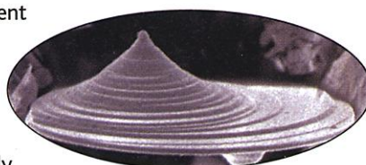
Terraces and spiral steps on a SnO diskette.

The controlled synthesis of a variety of nanosized objects has been reported for several oxide materials. For tin oxide, there have been previous reports on the synthesis of nanoscale tubes, wires, and ribbons. Dai et al. report on the preparation of single-crystalline disks, starting from either SnO or SnO 2 ; the disks formed at temperatures between 200° and 400°C and had a final composition of SnO. Two morphologies were observed: Two solid "wheels" fused together to form a drop-center rim, or a cone-like structure formed from a main disk and a series of spiral-stepped ridges.