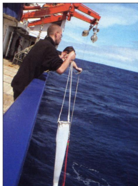
Loss of talent? Cancellation of NERC funding may force Britain's young scientists abroad.

NERC is one of seven agencies that channel government money into academic research. Its current woes stem from a failure in its new accounting system and overspending on staff salaries last year. In a statement last week, NERC announced that the cruel double whammy, its own doing, has forced it to save $28 million this year, although NERC has asked the government to contribute $8.5 million to lessen the blow.