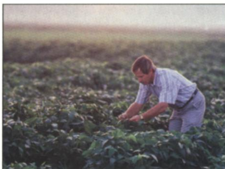
Look closely. An NRC panel says USDA should regulate biotech crops more rigorously.

The U.S. Department of Agriculture (USDA) needs to strengthen its procedures for approving field tests and commercialization of transgenic plants, a National Research Council committee concluded in a report released last week. Although transgenic crops don't pose a greater risk than that of products of conventional breeding, the committee said, traits introduced by either technique can pose risks to the environment. Ultimately, it added, the potential environmental impact of conventionally bred crops should also be assessed. But for now, to bolster its regulation