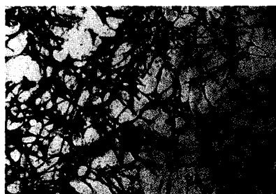
Stable expression of alkaline phosphatase in target cells transduced using the Retro-X System.

Rapidly introduce stably heritable genetic material into mammalian cells.