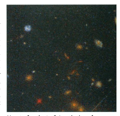
Heart of a cluster? A gathering of young galaxies.