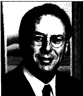
Daniel S. Goldin