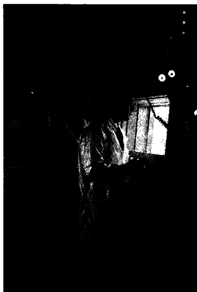
Looking into a hotcell at Battelle.

A Nordion spokeswoman says the company usually uses cobalt 60, but cesium makes for lighter weight irradiators. The capsules were manufactured by Westinghouse Hanford Co. and Battelle's Pacific Northwest Laboratory, which run the Hanford site, once a major source of materials for bomb production. Battelle claims to have some of the world's few "hotcells," specially shielded rooms with remote manipulators, where the cesium is purified, powdered, and pelletized.