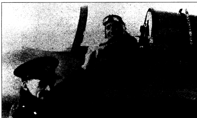
Birth of jet age. Frank Whittle shakes hands with test pilot after Britain's first jet flight on 15 May, 1941.

The Draper prize is a biennial award established in 1989. The first winners were Jack Kilby and Robert Noyce, inventors of the integrated circuit.