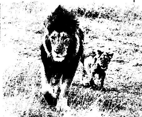
Fatherly lion. Others do without.

tives who act altruistically toward each other improve the odds that their family gene pool will survive, even though such behavior has a price for the individual. While this brand of altruism had been proven in ants, termites, birds, and wolves, it had not been demonstrated in lions.