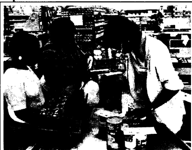
Mississippi mother buys prescribed food with WIC vouchers.