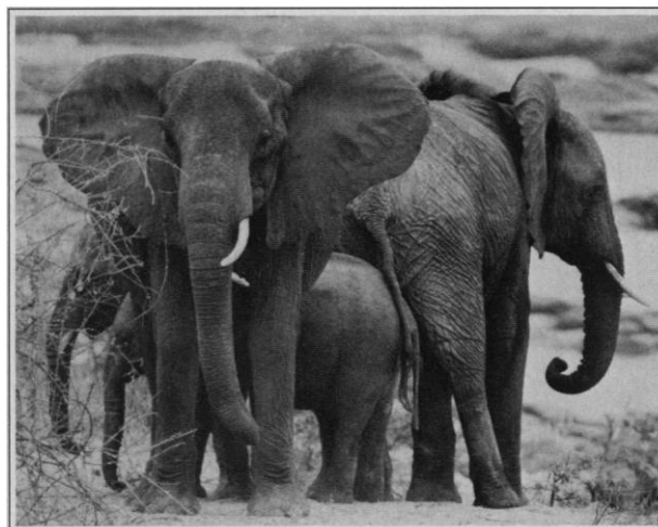
East African elephants

The sharp drop in poaching came immediately after an international ban on commercial trade in ivory was implemented in 1989. Leaky said the ban, along with an intensive campaign to persuade Western consumers not to buy ivory, ap-