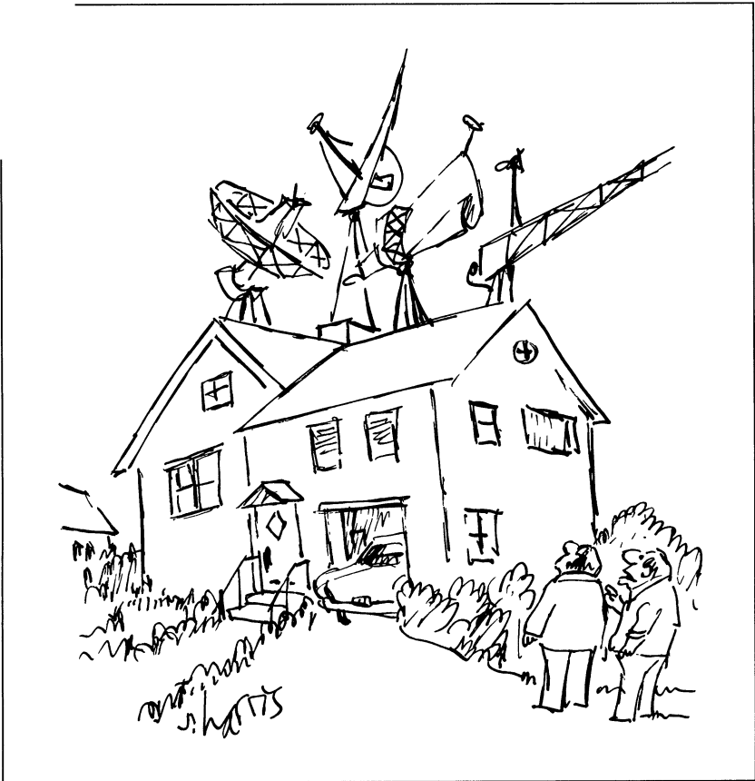
"One is to deflect cosmic rays, one is to ward off laser beams which the Russians are aiming at me, one is to divert microwaves that the Government is zapping me with, and one is to pick up movies from satellite TV."