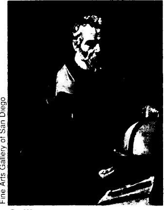
Galileo. An era of cheap science.

tion for Einstein's geometrization of gravity in his general theory of relativity. It stems from the fact that unlike other fundamental forces-electromagnetism and the strong and weak nuclear forces-gravitational acceleration can be expressed as a function of mass and is therefore comparable to inertial accelerations. "The more you think about it, the stranger this is," says Everitt. Any breakdown in the equivalence of gravitational and inertial mass would show limits to the theory of relativity.