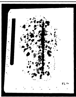
Get the cleanup crew. Aftermath of the Lewis steam explosion; a chunk of concrete from the vehicle assembly building at Kennedy.

*NASA Maintenance: Stronger Commitment Needed to Curb Facility Deterioration, U.S. General Accounting Office, GAO/NSIAD-91-34, December 1990.