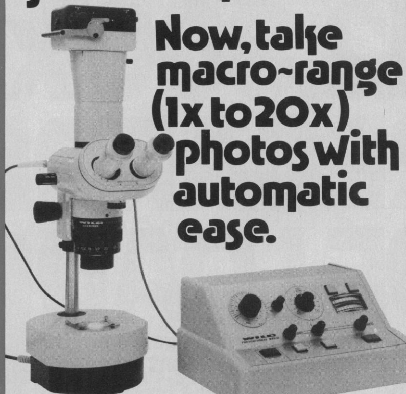
WILD M-400 PHOTOMAKROSKOP. The binocular automatic macro recording system, shown here with transmitted light illumination on darkfield / brightfield transillumination stand, with lens, and 35mm magazine.*

Now, take macro-range (1x to 20x) photos with automatic ease.