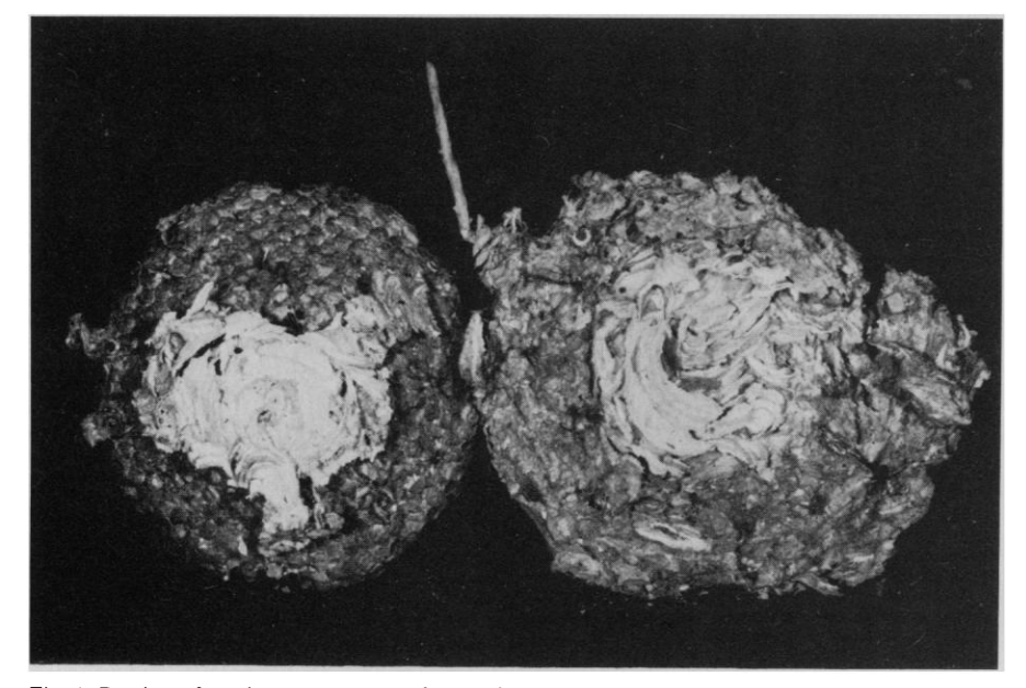
Fig. 1. Portion of a subterranean nest of Vespula squamosa. A typical mature nest would contain a stack of four to eight horizontal combs with cells opening downward, these being enclosed by a multilayered paper envelope. Nest expansion occurs laterally and downward, and the cavity is enlarged by workers as more space is needed. The dorsal surface of the oldest worker comb (left) and the inside of the envelope that covered it (right), which has been folded away from it, clearly show the lighter color and different texture of V. maculifrons paper in the center. This nest is approximately the size of a softball.

sent nests initiated by V. squamosa queens, in which case the parasitism is facultative. Since the smallest unequivocally usurped nest contained at least twice as many cells as a typical queen nest (9), V. squamosa queens may not discover host nests until after the first host workers become active. Alternatively, usurpation might occur so early in some colonies that it cannot be detected by study nest architecture. A precedent for the latter exists in another hostparasite Vespula pair; the inquiline V. arctica Rohwer queen and V. arenaria (F.) host queen are present together very soon after nest building and before emergence of host workers (10). Thus, the question of whether the socially parasitic behavior of V. squamosa queens is obligatory or facultative cannot be conclusively determined at this time (11).