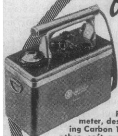
MODEL 2611 COUNT RATE METER

Portable, efficient meter, designed for detecting Carbon 14, Sulfur 35, and other soft radiation sources. Thin mica end-window probe, will also serve for use as gamma survey meter. One-hand operation. Life of G-M counter unlimited by use.