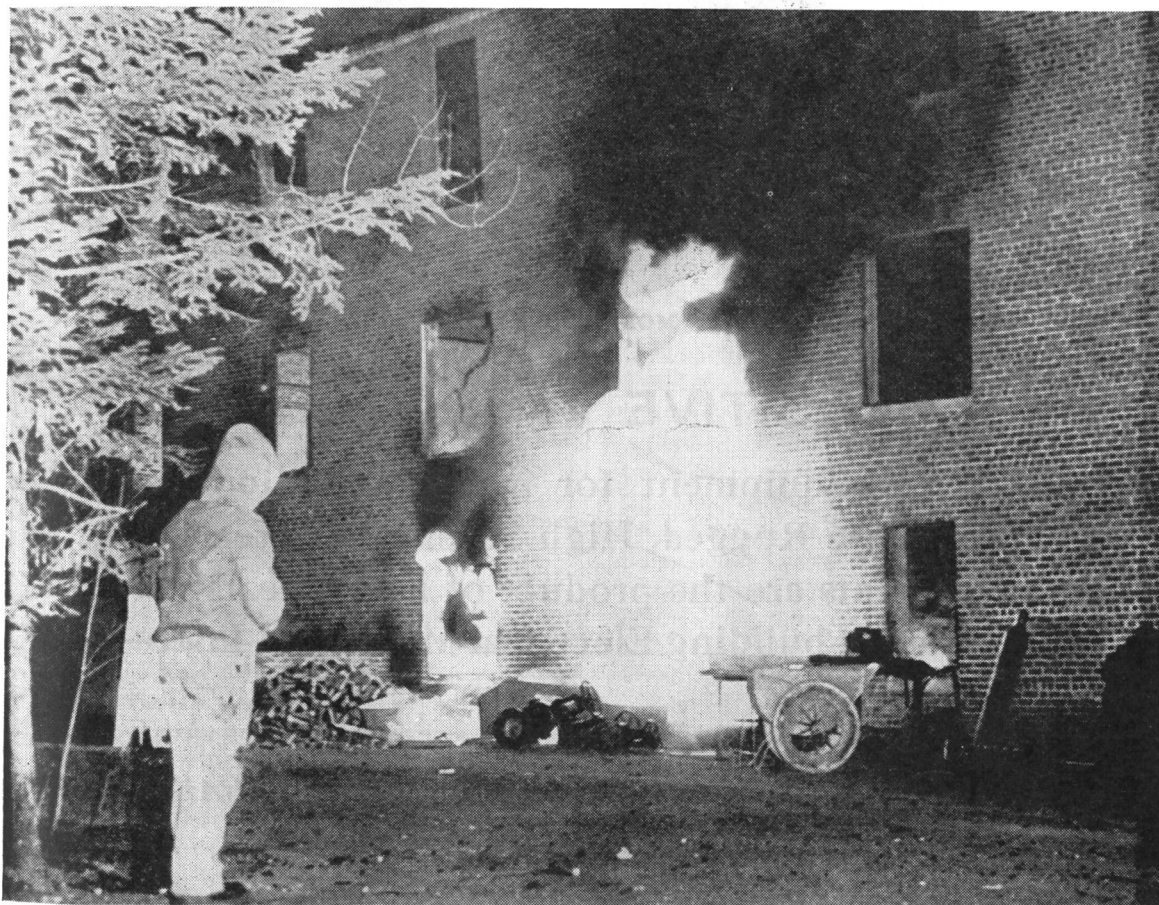
The Roscoe B. Jackson Memorial Laboratory for Cancer Research burning early on the morning of October 24 as a bystander watches helplessly (see Science , October 31).

Published by the AMERICAN ASSOCIATION FOR THE ADVANCEMENT OF SCIENCE