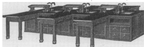
Lincoln Science Desk No. D-503

Call on Kewaunee Engineers to assist with your equipment plans. That's the way to make sure the furniture you install now will allow your school to grow. No charge or obligation for this valuable service.