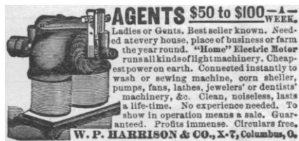
W. P. HARRISON & CO., X-7, Columbus, O.