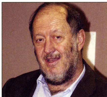
Stem cell flap. Press reports muddled the focus of Irving Weissman's new center at Stanford.

Stanford got in hot water after the institute stated an intention to develop new human embryonic stem (ES) cell lines to study particular diseases. During an interview with the Associated Press (AP), Weissman acknowledged that scientists might someday try to create human stem cell lines for this type of research through nuclear transfer—otherwise known as therapeutic cloning. The resulting AP story, declaring that "Stanford University has announced its intention to clone human embryos," forced Stanford officials to hold a press conference immediately to deflate the brouhaha. They followed it with a statement emphasizing that "creating human stem cell