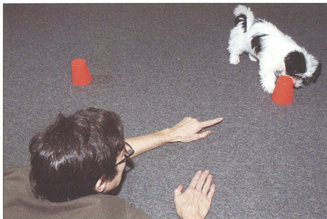
Point and Play. Puppies can follow human cues to find food hidden under cups, a communication skill wolves lack.