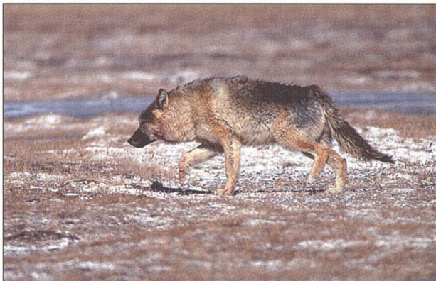
Dog father. Dogs might have evolved from an ancestor of this Chinese wolf.

Next the researchers tried the experiment on puppies to determine whether the behavior was innate or learned. They used 32 puppies, aged 9 to 26 weeks. About half lived with families; the rest lived with one another in kennels and had little exposure to people. Many did quite well, and "there was no