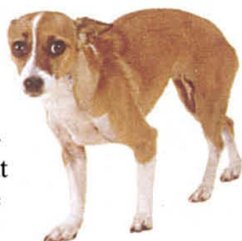
Common pedigree. From Chihuahuas (left) to Great Danes, dogs of all shapes and sizes share common ancestors.