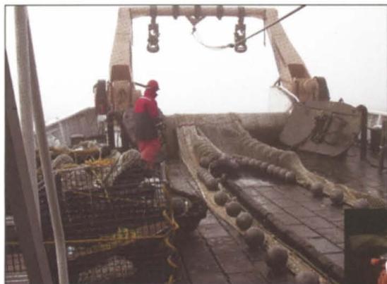
All wet? Critics say mismarked trawl net (above) might have biased fish population counts.

A misrigged trawling net has brought a haul of problems for the U.S. National Marine Fisheries Service (NMFS). The faulty net has been used for the past 2 years in NMFS