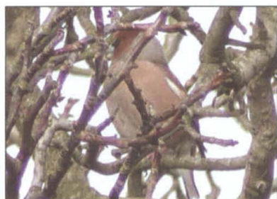
Two passerines—the woodlark (top) and the hawfinch (bottom).

data (two 4-year periods, 20 years apart) on the distribution of passerine birds in Britain, they find that the probability of absence in 10 km x 10 km tracts during the second period was negatively correlated to the probability of occurrence in the first period. Thus, greater success in conservation, in terms of minimizing extinction risk, may be achieved by selecting areas where the probability of occurrence is maximized. — AMS