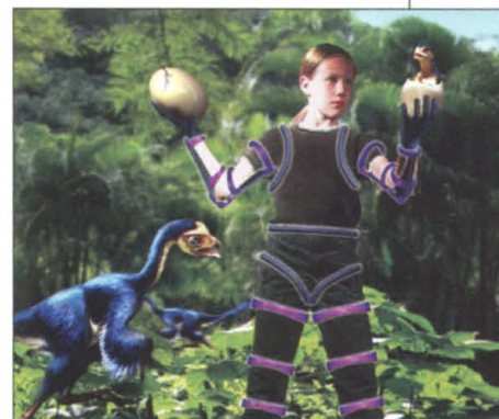
Iona witnesses birth of baby dino as she learns how birds evolved.