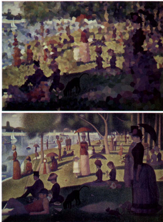
Is uncertainty the only thing that is certain? (13). Shown are two versions of the painting by George Seurat, A Sunday Afternoon on the Island of La Grande Jatte . (Top) The coarse-grained version represents the noise level affecting gene expression in the cell. (Bottom) The resolved version illustrates noise reduction and raises the question of whether different pictures (and if so, what number) could have been obtained by different noise suppression mechanisms. Far from being a nuisance, noise in living systems contributes to adaptation and evolution.

Lac-repressible GFP gene. Thus, the authors were restricted to measuring total noise (intrinsic plus extrinsic). They, too, adjusted the transcription rate by varying the concentration of IPTG, as well as by engineering mutations in the GFP gene's promoter. However, they found a weak positive correlation between total noise and transcriptional efficiency. Part of the discrepancy between these reports resides in a difference in how the two groups normalize the variance. One group's noise is the variance divided by the mean (5),