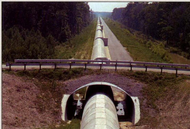
Earth tones. Local noise from traffic and logging still jitters the sensitive optics in LIGO's 4-km arms.

successful proposal this year would keep the project on track for an upgrade starting in 2006. In the minds of most observers, that's the only realistic chance for LIGO to see gravitational waves, as Advanced LIGO would search a volume of space 10,000 times larger than LIGO 1. However, the team is mulling whether to wait a year, pending progress in the first science run. "We're in this dilemma