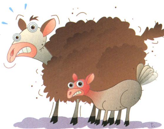
High-strung. Stressed-out ewes give birth to lambs with high blood pressure.

Bagby is using pigs to explore how stunted kidney development might, along with an overactive HPA axis, contribute to high blood pressure later on. Because kidneys control the body's balance of salt and water, they are a crucial moderator of blood pressure. Furthermore, the functional units of the kidney, called nephrons, all form before birth in humans. "The number of nephrons that you have is very important in determining the capacity of the kidney to deal with the world," says Bagby. Langley-Evans has found that low-protein diets during pregnancy cut the number of nephrons in rat offspring by a third. Researchers are only beginning to consider whether some kidney failure in adult humans might have its roots in the womb.