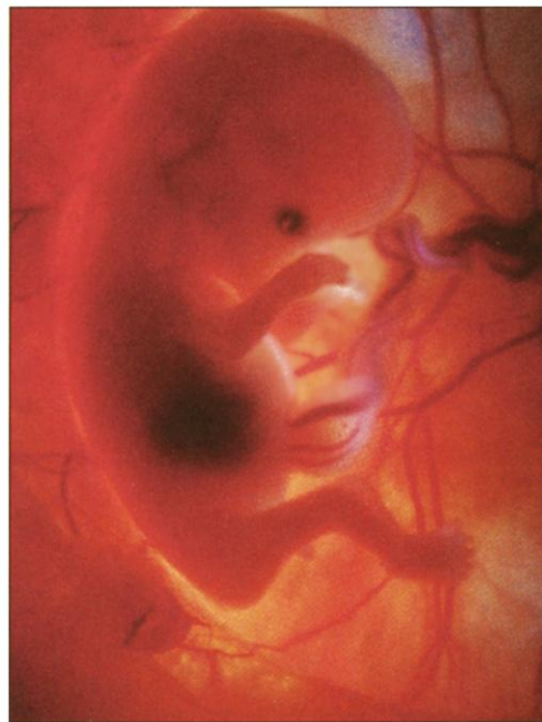
Taking shape. Conditions in the womb appear to have an impact on risk of disease in adulthood.

ences in birth weight, which rarely span more than 2 kilograms in full-term infants, are simply a rough marker for conditions encountered in the womb. A growing number of researchers are examining variables such as maternal stress, placental development, and embryo implantation that might underlie the perplexing find. Poorly formed kidneys, for example, might falter at regulating blood pressure. But for the most part, the mechanisms by which the fetal experience contributes to adult disease remain enigmatic.