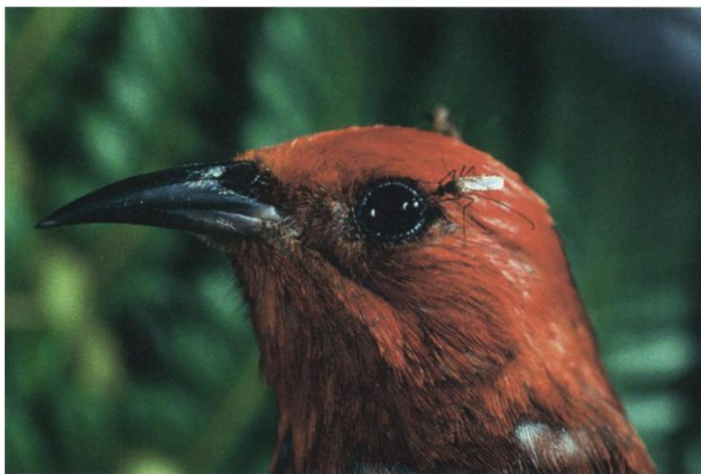
Fig. 3. Culex mosquitoes are the vectors responsible for transmitting avian malaria ( Plasmodium relictum ) and avian pox ( Poxvirus avium ) to endemic Hawaiian forest birds such as the apapane ( Himatione sanguinea ).

We found no unequivocal examples of nat-