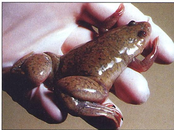
Sex change. In lab studies, male African clawed frogs become hermaphrodites when exposed to atrazine.

Now researchers led by developmental endocrinologist Tyrone Hayes of the University of California, Berkeley, report that in lab studies, male tadpoles develop extra gonads and become hermaphrodites at concentrations 30-fold lower than EPA's safe drinking water standard. The researchers raised