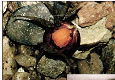
Yum. Orange fruit (above) and fruit-colored spots (right) catch a guppy’s eye.