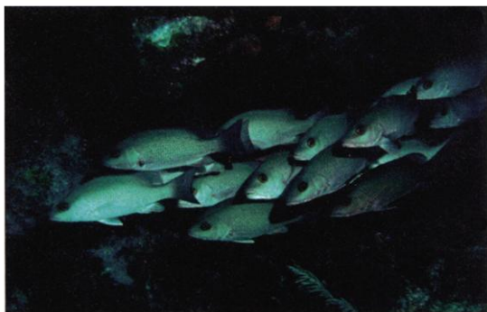
Populations of high-value fish like these gray snapper have rebounded inside and outside marine reserves in St. Lucia.