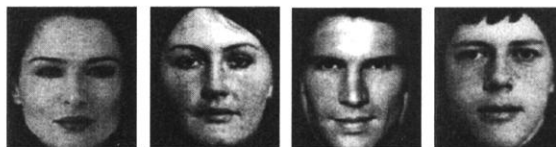
Pretty woman (l) activated straight men's reward circuit; beautiful guy (second from r) suppressed it.

scan, where pretty women activated reward circuits. As for "beautiful" males, they not only got less viewing time, but their