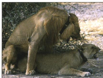
Lions mate in Waza National Park, Cameroon.

Bauer says lions are especially tricky to count. "Aerial counts, roadside counts, sampling meth-