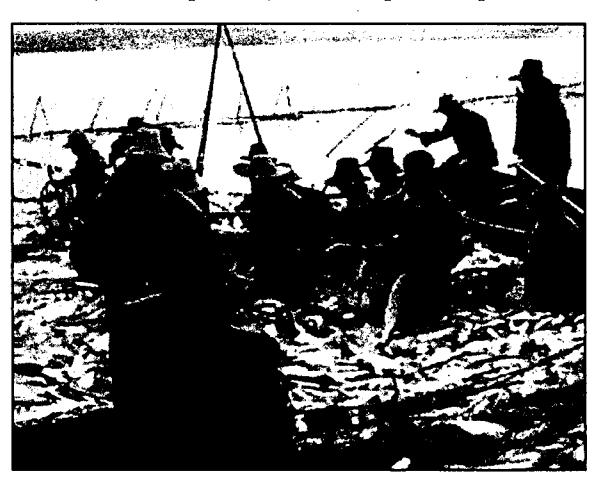
Chinese fishermen harvest bighead and silver carp—an economic boom, but a potential ecological bust.

BIGHEAD AND SILVER CARP, WHICH ARE NATIVE to eastern Asia (1), have been popular species for aquaculture and algal control (2), and since the 1960s, both fish have been introduced worldwide—silver carp into 34 countries and bighead carp into more than 20 countries. But, as J. H. Chick and M. A. Pegg discuss in their letter "Invasive carp in the Mississippi River Basin" (22 Jun., p. 2250), these carp can