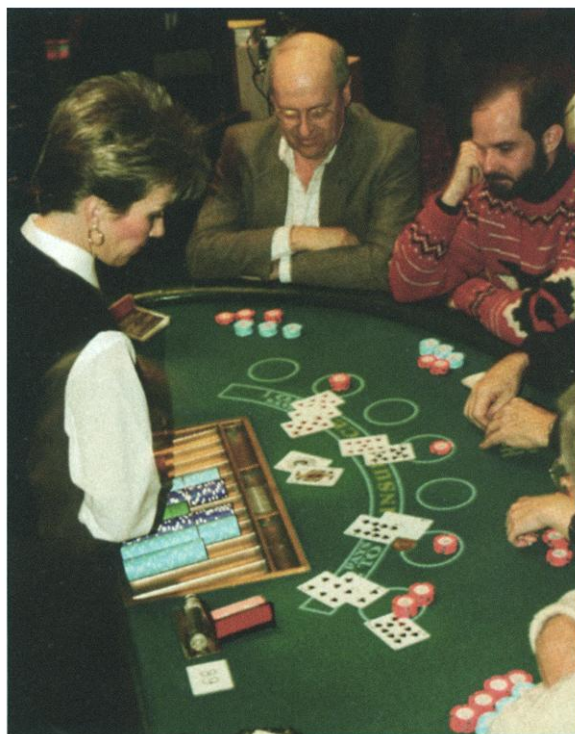
Getting a fix. Gamblers get high and show tolerance and withdrawal symptoms—a lot like drug addicts.

Furthermore, what's going on inside gamblers' heads looks like what goes on in