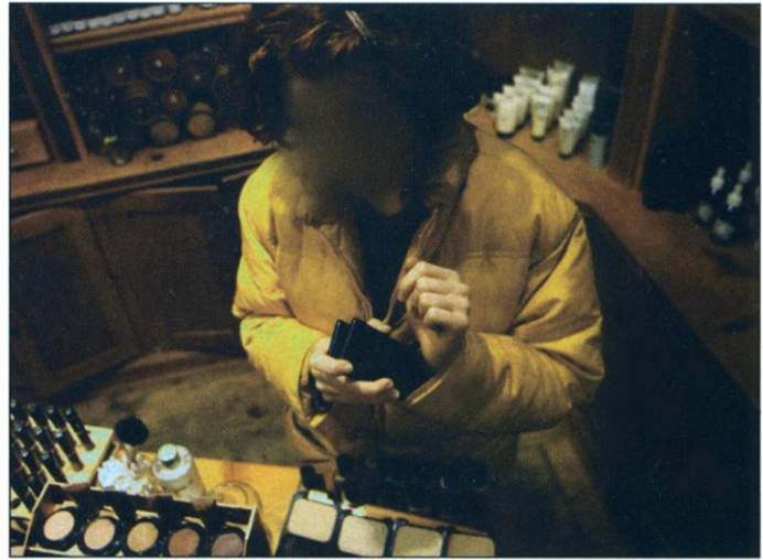
Buying high. Compulsive shoppers, mostly women, go on binges triggered by anxiety and depression.

sponses of normal males in a roulette-type game of chance. Blood flow in dopamine-rich areas, the scientists found, indicated that “the same neural circuitry is involved in the highs and lows of winning money, abusing drugs, or anticipating a gastronomical