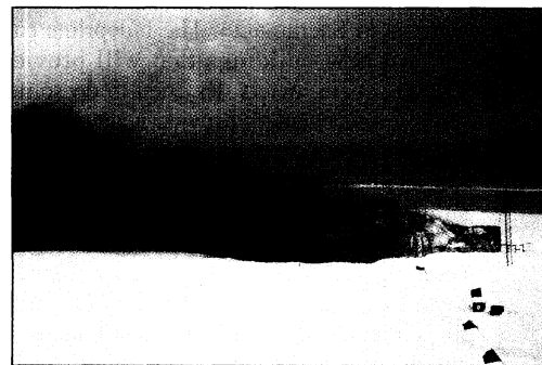
Ablaze. In high winds, researchers had to let the lab burn itself out.

The cause of the fire that consumed the Bonner Laboratory at Rothera Research Station on the Antarctic Peninsula is still unknown, but the loss of the lab will set back