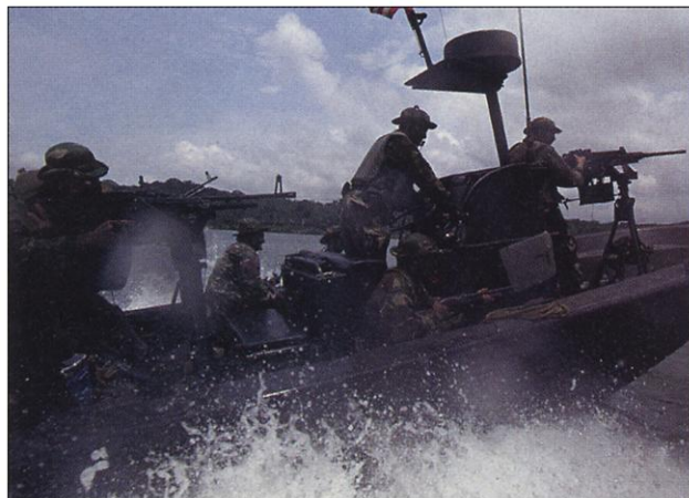
Secure science. U.S. oceanographers hope that they won't need help from Navy SEALs, above, in plying waters in the Middle East.