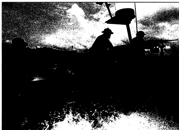
Secure science. U.S. oceanographers hope that they won't need help from Navy SEALs, above, in plying waters in the Middle East.