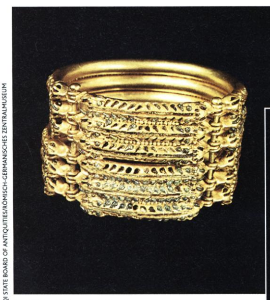
Golden oldies. This finely wrought bracelet incorporates stylized snake heads into the design. The piece is evidence of highly developed crafts in Assyria.