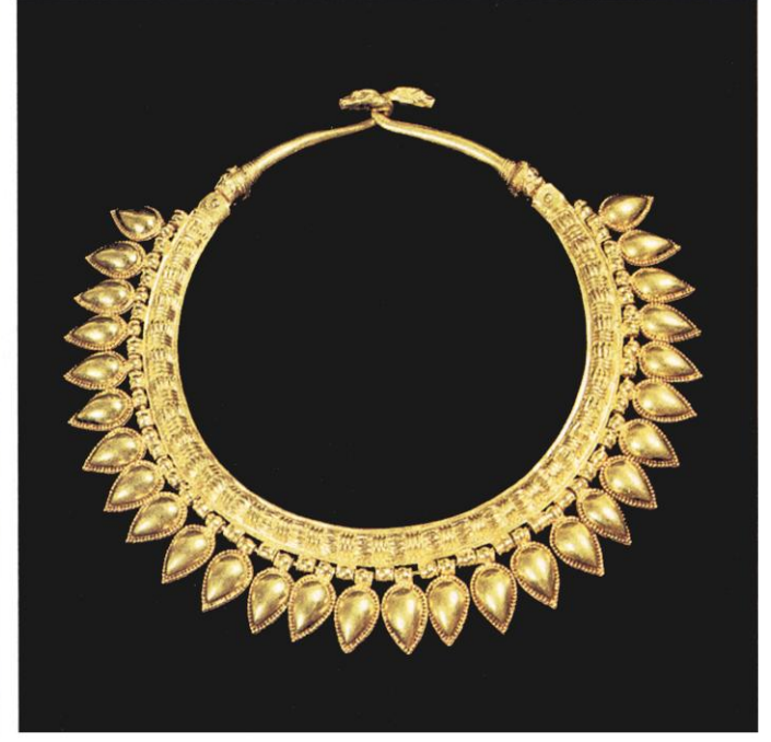
Fit for a queen. A delicately crafted gold crown and necklace from the 8th century B.C. were among the finds at Nimrud, ancient Kalhu.

King Tutankhamun's tomb. Hundreds of finely wrought gold objects in excellent condition were unearthed here, along with inscriptions identifying the remains of three Assyrian queens, consorts to leaders of a vast 8th century B.C. empire.