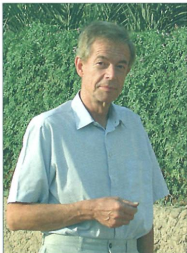
Old times. Gunther Dreyer found ancient writing in Egypt that may predate cuneiform.

Skeptics also insist that there is little evidence that cuneiform grew directly out of this system, as Schmandt-Besserat maintains. Token shapes and the impres-