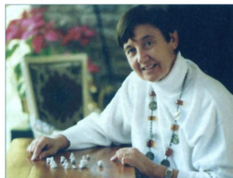
Code breaker? Denise Schmandt-Besserat maintains that clay tokens and spheres led to cuneiform.

Meanwhile, attempts to accurately date materials from both Egypt and Mesopotamia have proven inconclusive. Recent radiocarbon dating in Heidelberg of charcoal from both an Uruk temple, where early cuneiform tablets were found, and the Abydos tomb showed a date of approxi-