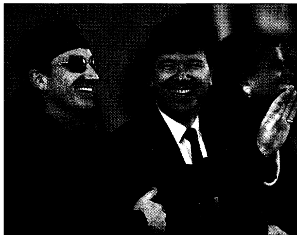
Tryin' to throw his arms around the world. Jeffrey Sachs has teamed up with U2's Bono and the Pope in a crusade to reduce disease rates in poor countries.