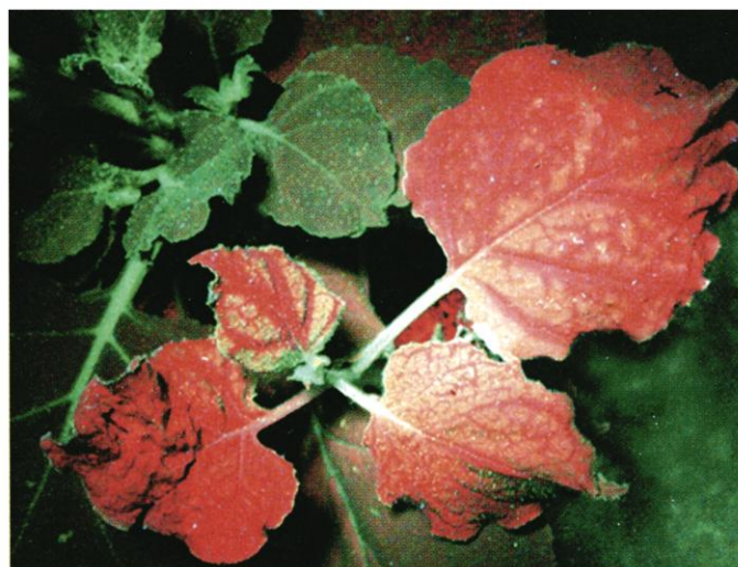
Fig. 1. RNA silencing on the move. Movement of the mobile silencing signal in a GFP-expressing tobacco plant is visualized as a red trail where GFP has been silenced, revealing red fluorescence of chlorophyll in the background of green fluorescence from GFP.

In our model, silencing mediated by dsRNA and by viral RNA are separate branches of the pathway that merge with the sense transgene-silencing branch at the step of dsRNA accumulation. Evidence for these separate branches of the pathway comes from studies of the effect of dsRNA continuously produced by a transgene or delivered exogenously by a virus into silencing-defective mutants of Arabidopsis . VIGS occurs in Arabidopsis RdRP ( sgs2/sde1 ) and RNA helicase ( sde3 ) mutants impaired in silencing of a sense transgene (22, 26). Similarly, silencing mediated by transgenes producing dsRNA occurs in RdRP ( sgs2/sde1 ), coiled-coil ( sgs3 ), and PAZ/Piwi ( ago1 ) mutants (45). Studies of RNA silenc-