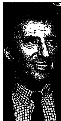
Lang. University system is "too congealed."

The ministry intends to bring France into the European Credit Transfer System, developed by the European Union in the 1990s to help standardize course credits between E.U. countries and to encourage student exchanges. In a 23