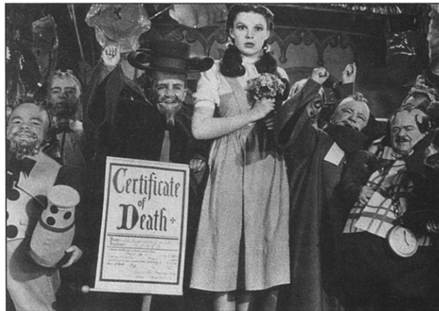
Most sincerely dead. Like the Wicked Witch of the East, the theory that AIDS was spread by a polio vaccine has been discounted.