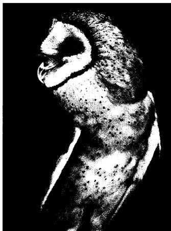
Where did it go? Some barn owl neurons multiply location signals.