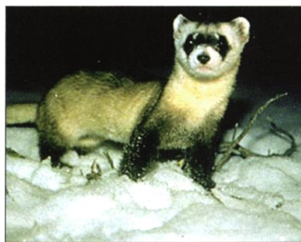
To the rescue. The black-footed ferret is one of several species helped by Smithsonian center.

In a staff memo, Spelman explained that "the resources are simply not available to maintain the CRC as a world class facility," even though Small insists that conservation research remains important to the Smithsonian. The CRC gets about $5 million per year in federal funds. The materials center, which was set up in 1963 to service all the museums, has a federal budget of about $3.3 million per year, but Small says it is "not an area of high priority" because most individual museums now have their own preservation pro-